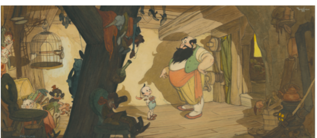
Gustaf Tenggren, Pinocchio concept art; collection of the Walt Disney Animation Research Library, © Disney

Disney Studio Artist, Blue Fairy cel, Paint on cellulose acetate and opaque watercolor on paper; collection of David Pacheco, © Disney