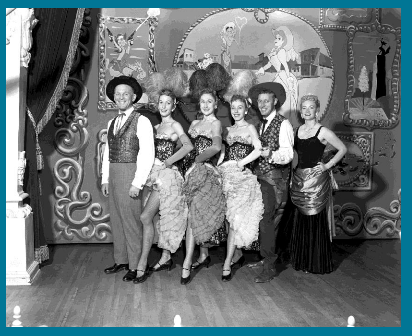
Golden Horseshoe Revue