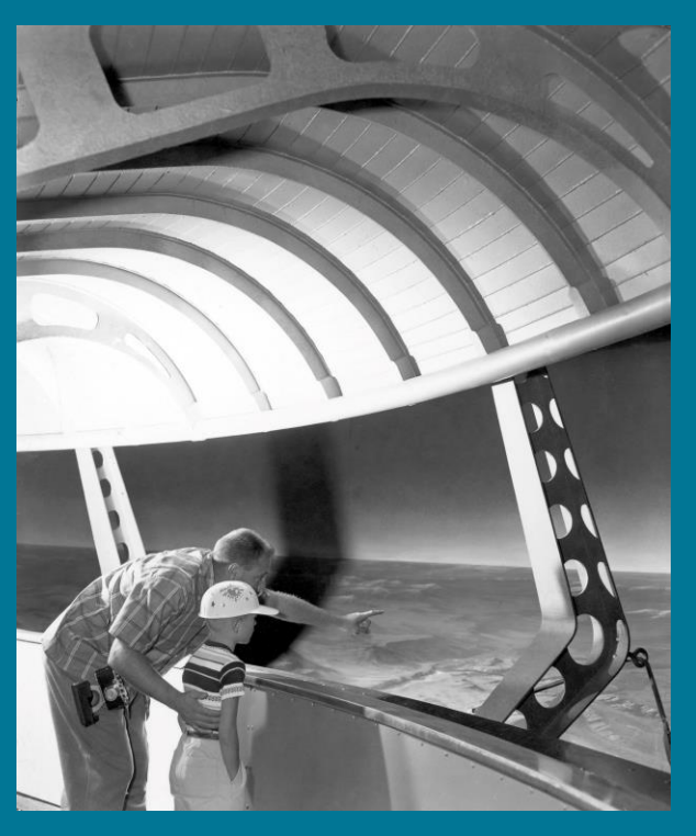
Space Station X-1